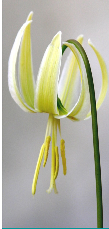
Fawn Lily (Erythronium Oregonum) Flower season March to August A great plant for pollinators!