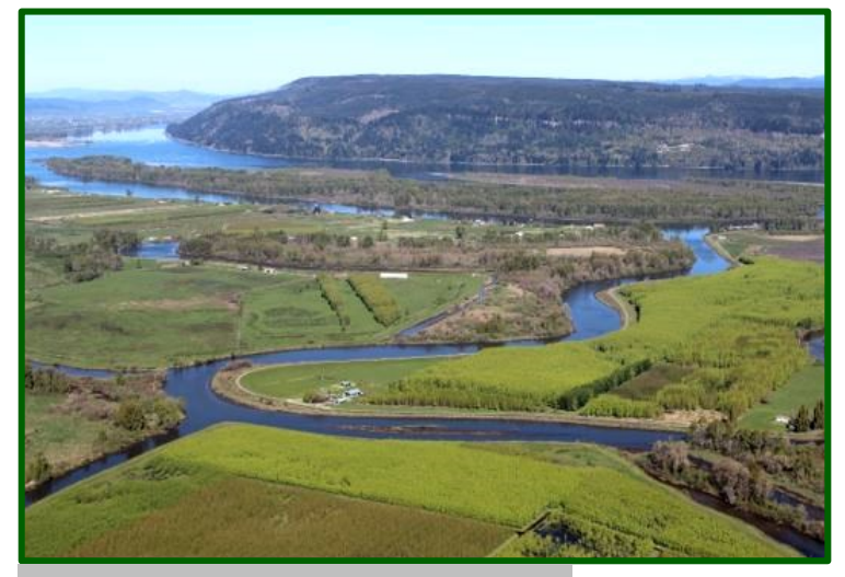
The Lower Columbia River Watershed encompasses 298 square miles along the Columbia River in Columbia County, Oregon.

LCRWC is building a strong portfolio of aquatic habitat restoration projects following the findings of a completed Strategic Action Plan(SAP). The SAP provides direction to stream sections with high ecological value for multiple aquatic species. In the last year, we have brought in additional information from completed assessments to include lesser-known species such as Columbia River Chum Salmon and Pacific Lamprey. Historically these