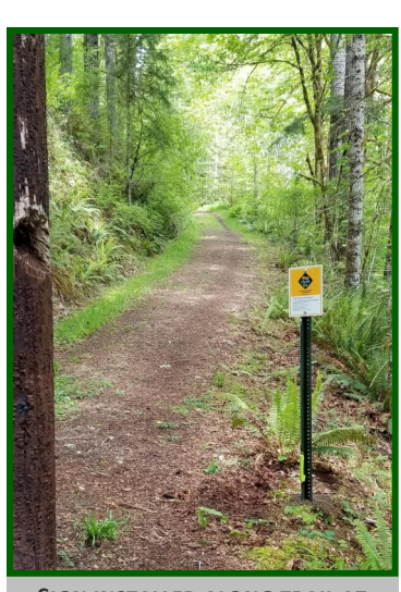
SIGN INSTALLED ALONG TRAIL AT FISHHAWK LAKE

at a lake kiosk, native plants for affected landowners, and outreach events. The Columbia SWCD partnered with both Clatsop and Tillamook SWCDs to make this project a cross jurisdictional collaboration.