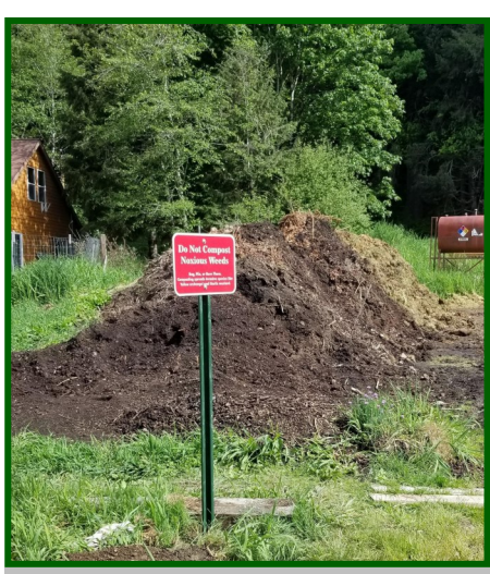
"DO NOT COMPOST NOXIOUS WEEDS" SIGN INSTALLED AT FISHHAWK LAKE GARDEN AREA