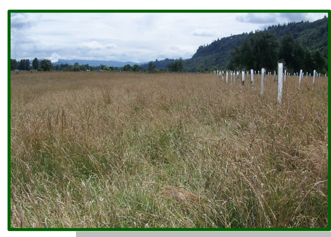
Shrub plantings and healthy forage stand for Columbian white-tailed deer habitat

1-Forest Management Plan, 15.7 acres of brush management, 5 acres of weed treatment, 2-High Tunnels, cover crops, 24.5 acres of slash treatment, 160 feet of hedgerow, 1340 feet of irrigation pipeline, 2-pumps, 23 acres of pasture and hayland plantings, 3-Roof Run-off Structures, 7.2 acres of tree planting, 343 acres of Upland Wildlife Habitat Management, 43.4 acres of Early Successional Habitat Management and 124 acres of Forest Stand Improvement on 10 farms.