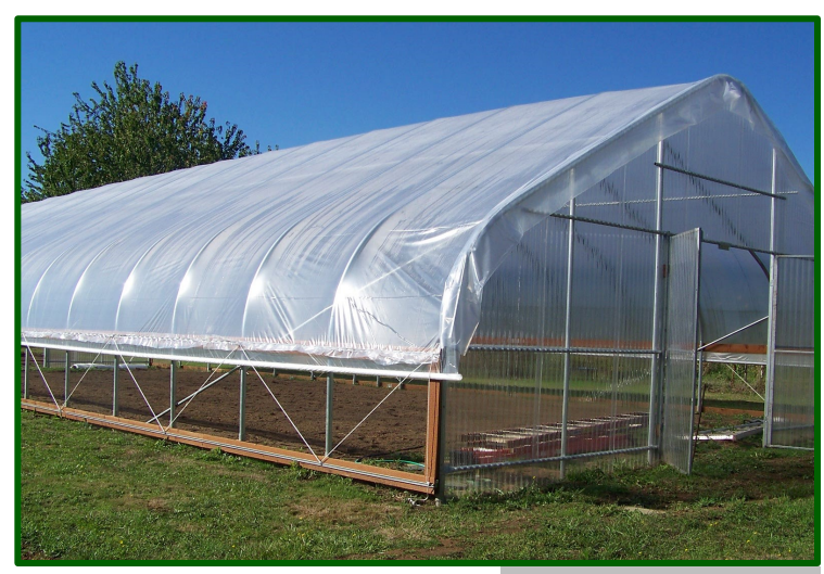
New high tunnel in Warren