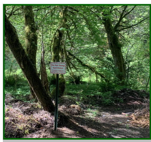
"DO NOT DUMP YARD DEBRIS" SIGN INSTALLED ON OREGON DEPT. OF FORESTRY LAND CLOSE TO FISHHAWK LAKE

In addition to these grant funded projects, SWCD staff worked on manual removal of Spotted knapweed in the summer of 2019 at a site along Walker Road in Scappoose, and monitoring of Policeman's helmet at a previously infested site along historic Highway 30 in Goble. Only one plant was found and removed during monitoring for Policeman's helmet.