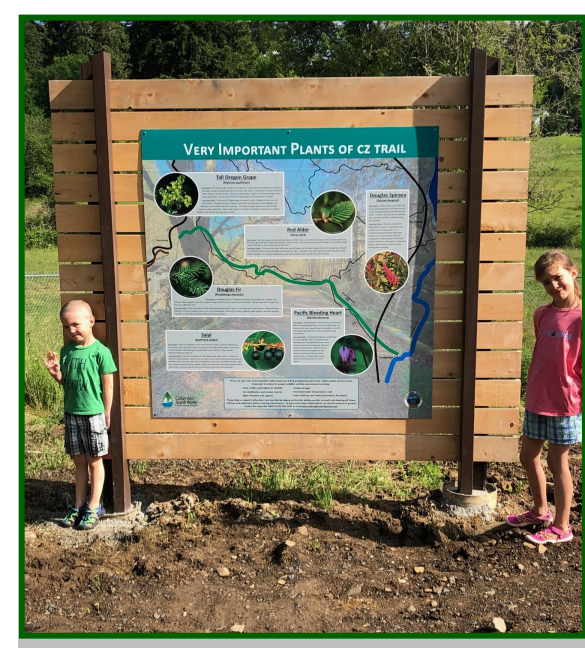
LARGE CUSTOM DESIGNED NATIVE PLANT SIGN INSTALLED AT RULEY TRAILHEAD ON CROWN ZELLERBACH TRAIL

A second round of treatment was conducted at Fishhawk Lake for Garlic mustard and Yellow archangel in the spring of 2020. This work was paid for by a grant obtained in early 2019 from the OSWB. The grant also paid for the installation of informational signs and boot brushes at key areas, updated educational signage