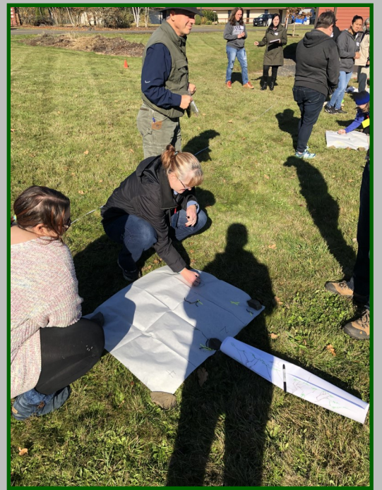
Above photos were taken during the PLT Workshop in October 2019

In 2019 the Columbia SWCD implemented a new environmental education program utilizing award winning Project Learning Tree (PLT) curriculum. We delivered PLT lessons along with premade activity kits, designed by the SWCD, to participating elementary schools at the beginning of the 2019 school year. In October the SWCD hosted a workshop for educators taught by PLT facilitators Participants included local elementary at our office. school teachers and non-formal educators from Columbia County, as well as some educators from further away. To date we have developed and delivered activity kits for 7 different PLT lessons to 8 elementary schools and 1 preschool. These kits are reusable and stay at the schools to be used again each year. We are excited to continue building on this foundation to bring more quality and engaging environmental education opportunities to our county!