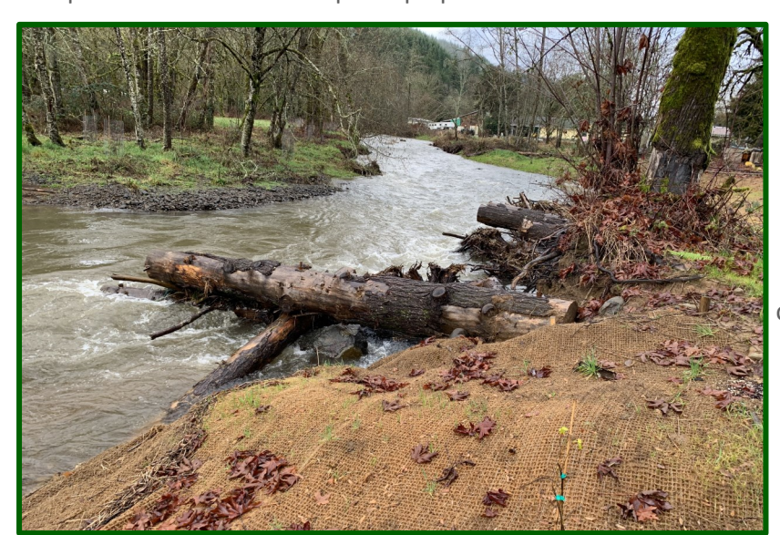
North Scappoose Stream Restoration project. January 2020

The Council had many projects in various stages of completion when the Covid-19 Pandemic hit. Like everyone else, we scrambled to adjust to this uncertain future and are continuing to adapt to the current working conditions. Luckily, our grant funders were very understanding and worked with us to extend project deadlines and reconfigure budgets. Unfortunately, we did have to cancel our Spring Plant Sale, our biggest fundraiser of the year. We have been working hard to reconfigure our Plant Sale strategy for the future, adding online resources, pre-order and curbside pick-up options.