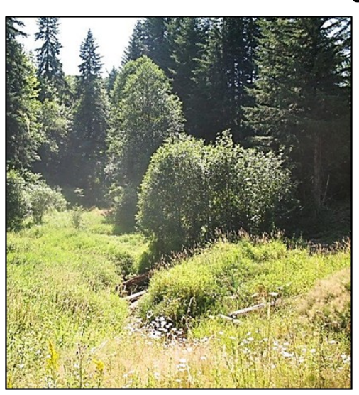
Elk Creek after LWD Replacement