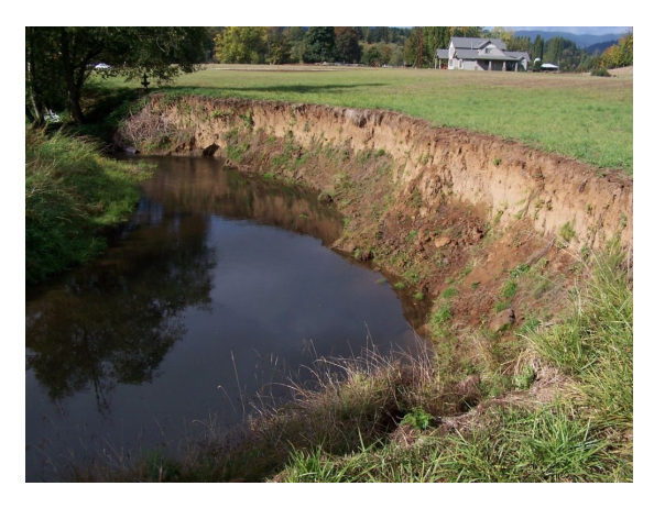
S. Scappoose Creek Before