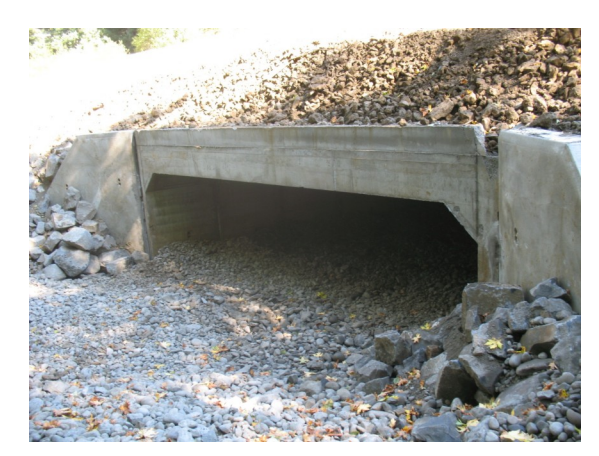
Elk Creek/Scappoose Vernonia Hwy Salmon Passage