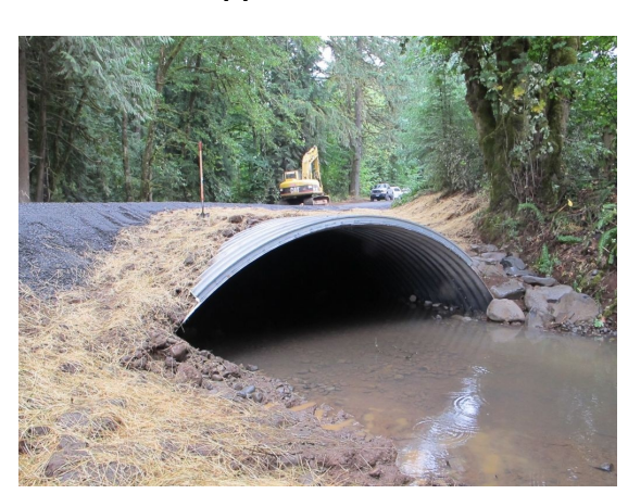
Culvert on Salmon Creek