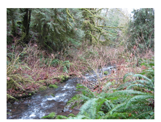
Fox Creek Before

Working together with landowners and land managers, the Columbia and Clatsop SWCD's, USDA NRCS and others continues to build the partnerships that the Council depends on to successfully develop and implement worthwhile projects and to help citizens preserve a healthy watershed.