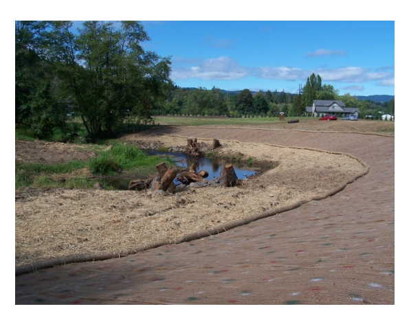
S. Scappoose Creek After