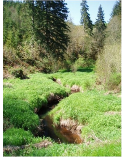
Elk Creek before LWD Replacement