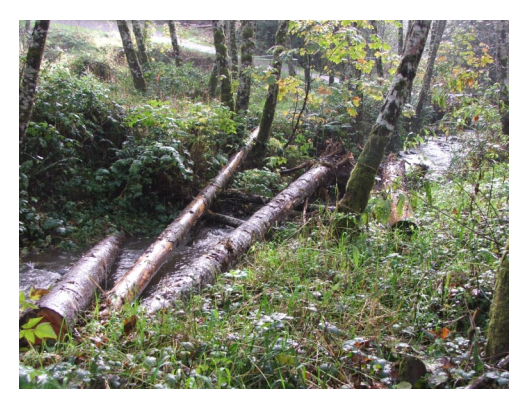
Fox Creek After