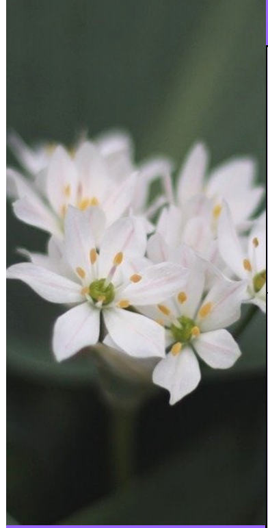
More info: www.nwplants.com