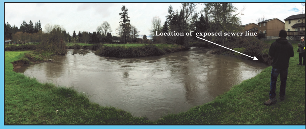
S. Scappoose Creek still close to bankful in March 2016. The channel is C-shaped at thi location and heavily incised contributing to the generation of strong and concentrated erosive forces. The lack of a floodplain and vegetation also contributes to erosion.

riparian area is completely devoid of native vegetation. However, the creek still hosts some juvenile salmonids in the late spring/early summer before the water temperature gets too high. The Columbia SWCD saw an opportunity to help the residents and City of Scappoose while doing some good for nature.