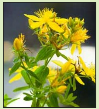
St. Johnswort: Invades disturbed areas, roadsides, pastureland, trails, and especially overgrazed areas. Mildly toxic to livestock.