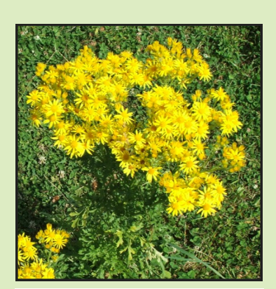
Tansy Ragwort: Invades open areas, pastureland, roadsides. Reproduces by seed only. Diminishes quality forage and is toxic to some livestock.