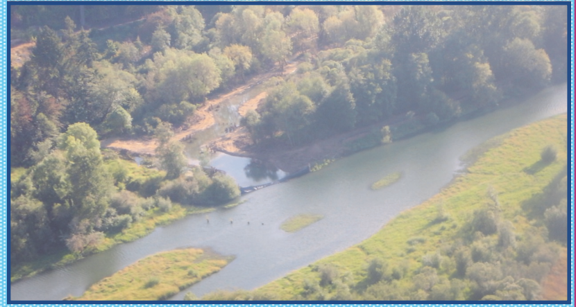
Photo taken during construction of tidal channels' connection with the Columbia River.

things like dyking, filling, and installation of flood control structures. This project also provides improved wetland habitat for other native species including birds, amphibians, and reptiles.